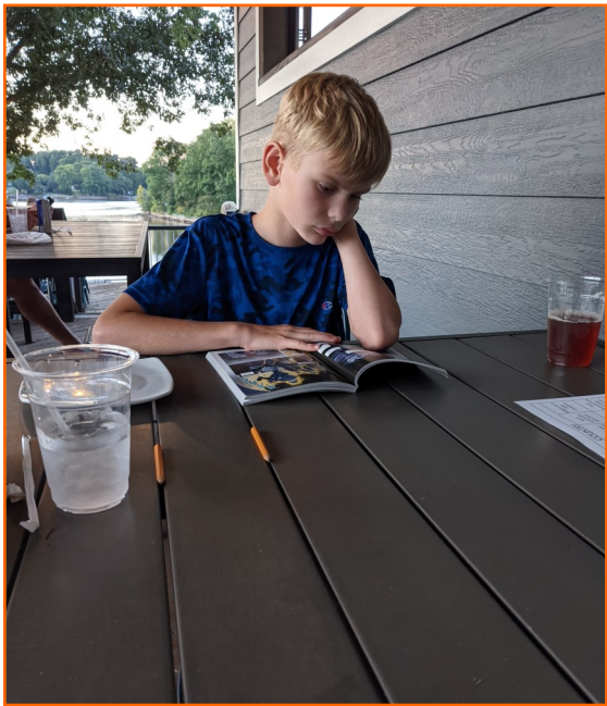
Pleasure reading before dinner: RCLC youth literacy student absorbed in a good book.

These students come to us making statements like, “I don’t read,” and “I don’t like school.” Working with tutors, they learn techniques to understand syllabification, recognize prefixes and suffixes, expand sight word mastery, and much more. Each new skill increases reading fluency and ultimately, comprehension. Reading becomes enjoyable once comprehension improves. The goal is for students to go from reading-averse to reading-receptive and eventually become reading-proficient. As one parent commented, “We can see more improvement in a few