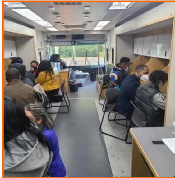
Jam-packed: Not an empty seat in sight in the NCWorks mobile career center unit.

The well-attended workshop helped students in 10th, 11th, and 12th grades create starter résumés that they can use and as they enter the workforce. Better yet, the students left with an understanding that a résumé is a living document, that should be updated frequently and tailored to each position for which they apply. The future looks bright for these ambitious students!