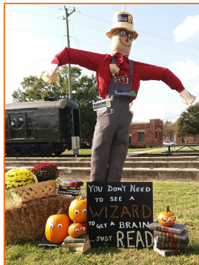
RCLC's bookish friend "Wordsworth" was on display at the North Carolina Transportation Museum's Scarecrow Stroll during the month of October.