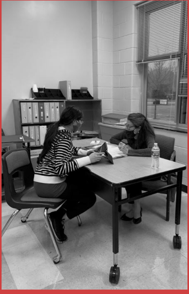
ROWAN COUNTY LITERACY COUNCIL