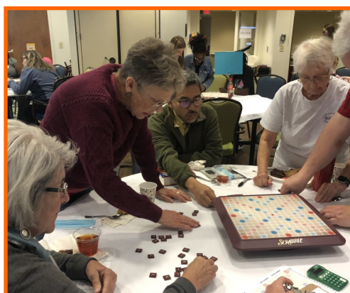
Team Lund making their game plan.