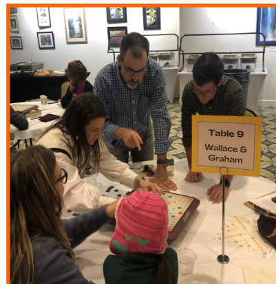
In the Zone: The Wallace and Graham team carefully mapping out their board.