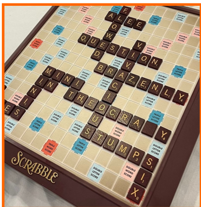
Brazenly Question: RPL Teen Team pulled off a close second-place performance.