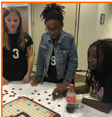
Teamwork: North Hills team was on fire during the competition!