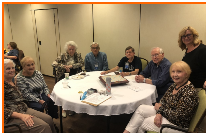
A Defended Title: For the 7th year in a row, Trinity Oaks placed first in the wordsmithing competition.