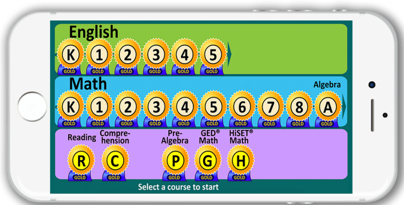
The home screen of the Learning Upgrade app shows the different levels of English and Math attainment that students may complete. Each level contains 60 lessons.

If your student has a smartphone, enrolling them is simple. Notify the office to receive login information, then have the student go to the app store and search for “Learning Upgrade.” Students must have a 75% or better success rate in order to receive credit for a lesson. All student progress may be monitored via our RCLC “school” account. Students may only move through the material by demonstrating competence, and lessons may be repeated until the student attains a score of 75% or better.